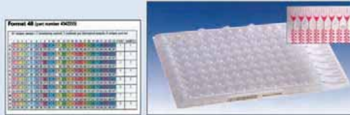
Fig. Micro-Fluidic-Card

IKDT Innovative Diagnostics is offering its service on performing gene expression studies and microRNA profiling by validated TaqMan QPCR assays or TaqMan QPCR Low-Density-Arrays on Micro-Fluidic-Cards (Applied Biosystems) for simultaneous detection of up to 384 genes or microRNAs in a single sample, including RNA isolation, preamplification technologies and final evaluation of expression data.