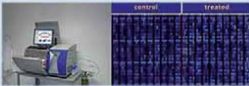
Fig. GENIOM RT Analyzer and chip

GENIOM biochips are a flexible platform for design of general chip layouts (whole genome arrays, microRNA profiling) and customized set-ups for individual research approaches like microbial typing (bacteria, fungi) or for combined analysis of two or more species (human, mouse, virus) in one sample. The GENIOM biochips contain 8 arrays with up to 15.000 probes. Currently available are pre-designed probes for gene expression analysis and microRNA profiling of more than 20 species which can be placed on customized biochips. IKDT is able to measure your GENIOM biochips by its own GENIOM RT Analyzer and in-house adapted labeling protocols.