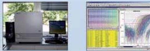
Fig. ABI Prism 7900 and screenshot of TLDA analysis

The TaqMan Array Human MicroRNA Card Set is a two card set containing a total of 384 microRNA assays per card. The set enables accurate quantitation of 754 human microRNAs in less than 5 hours. Confirmation of regulated microRNAs can be performed by individual TaqMan microRNA assays (more than 900 systems for human).